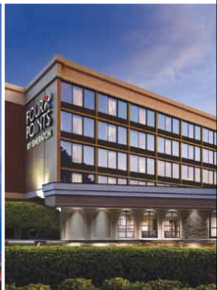
HOTELS FROM LEFT W TAIPEI, TAIWAN // LUGAL, A LUXURY COLLECTION HOTEL, TURKEY // THE WESTIN LIMA HOTEL & CONVENTION CENTER, PERU // FOUR POINTS BY SHERATON MEMPHIS EAST, UNITED STATES